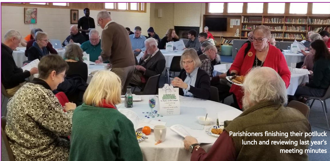
Parishioners finishing their potluck lunch and reviewing last year's meeting minutes