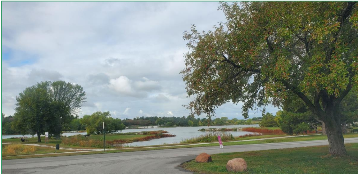
Holmes Lake on October 15, the calm before the fundraising walk that raised nearly $100,000 citywide for the American Cancer Society