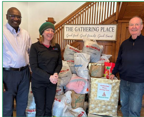
A past year's donation to the Gathering Place